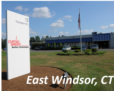
East Windsor, CT